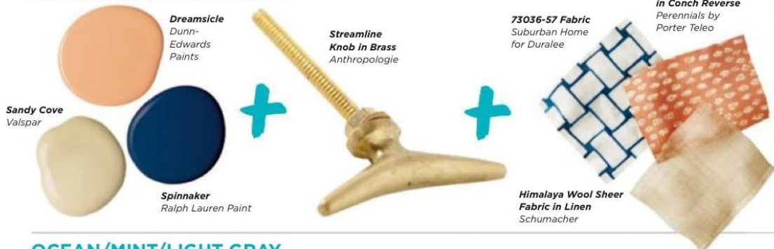
Elements Fabric in Couch Reverse Perennials by Porter Teleo

“What a totally groovy living room this would be, and a great twist on red, white, and blue. It’s relaxed and energetic at the same time.”