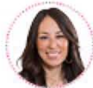
Joanna Gaines, Fixer Upper