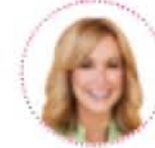
Lara Spencer, Flea Market Flip