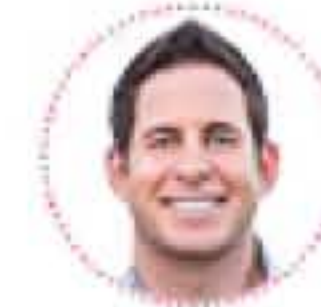
Tarek El Moussa, Flip or Flop