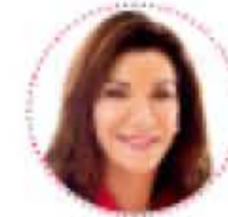
Hilary Farr, Love It or List It*