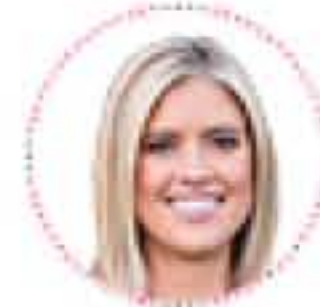
Christina El Moussa, Flip or Flop