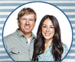
CHIP & JOANNA GAINES